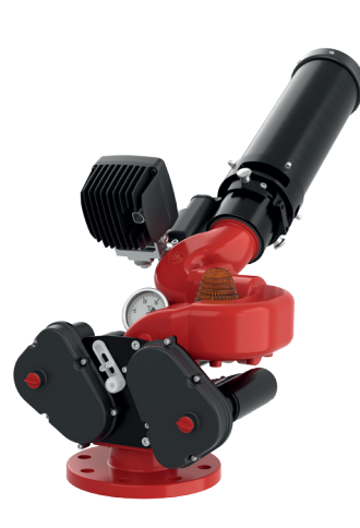
APF 2-DC EVO with multi-purpose nozzle MZV 2000/400, SWA 2000 DC foam attachment, pressure gauge and flashing light*

The electrically driven Alco PowerFighter monitors APF 2-DC EVO are approx. 1 kg lighter, smaller and even more powerful drives and, due to protected gear units, are also significantly robuster in use than their predecessors – with the same output!